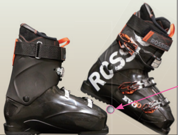
Image of boots storage

Boots are stored in a vertical row on corrosion-resistant stainless steel pipes.