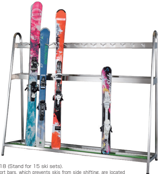
○KTD-1518 (Stand for 15 ski sets). Top support bars, which prevents skis from side shifting, are located hight 1200mm from the bottom of the skis.

The stands installed at the entrance of lodges and accommodations are Rust-resistant products made of stainless steel.