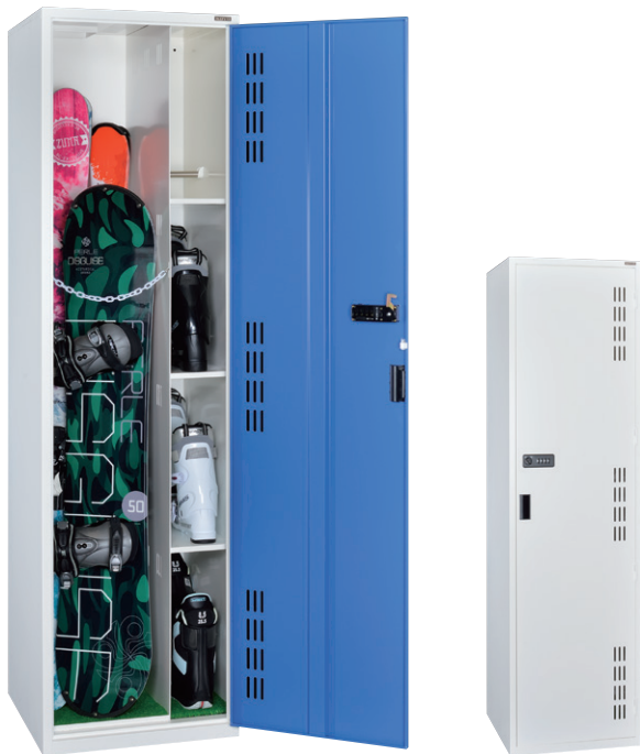
EKP-4 : Locker for 4 set of Ski/Sowboard equipment H.2000 W.550 D.550 Reinforced Doors, Combination Lock (Auto Zero Reset), Shelf x3, Stainless-steel Hanger Pipe x4, Mattress, Guard chain, Ventilation on top ceiling, Adjusters ※Products made of Flag Hinges, Electrogalvanized Steel.

Lockers can be made of molten galvanized steel (highly corrosion resistant) in shapes and sizes to suit facilities.