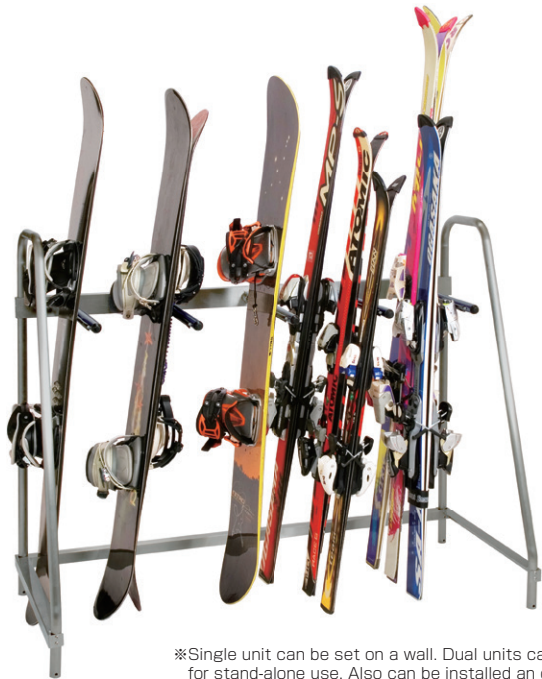
※Single unit can be set on a wall. Dual units can be connected back-to-back for stand-alone use. Also can be installed an optional bottom plate.

KTD-1218 (Stand for 12 sets of all-round skis) H.1500 W.1800 D.500 Stainless steel, Mattress with tray. ※Holds max133mm wide skis.