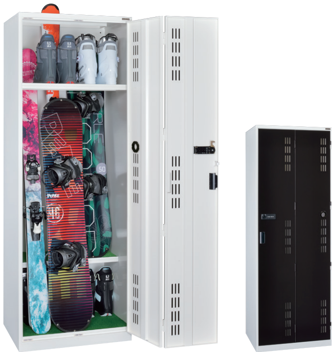
EKD-4 : Locker for 4 set of Ski/ Sowboard equipment H.2000 W.700 D.550 Reinforced Doors, Combination Lock (Auto Zero Reset), Shelf x2, Mattress, Ventilation on top ceiling, Level adjusters ※Products made of Flag Hinges, Electrogalvanized Steel.