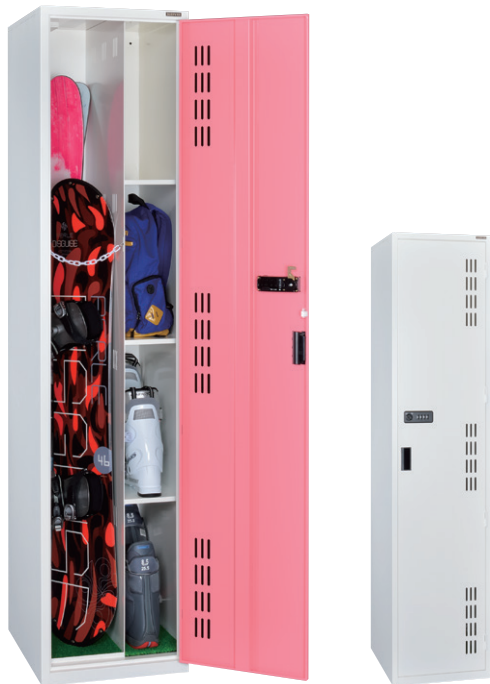
EKP-2 : Locker for 2 set of Ski/Sowboard equipment H.2000 W.450 D.550 Reinforced Doors, Combination Lock (Auto Zero Reset), Shelf x3, Stainless-steel Hanger Pipe x2, Mattress, Guard chain, Ventilation on top ceiling, Adjusters ※Products made of Flag Hinges, Electrogalvanized Steel.