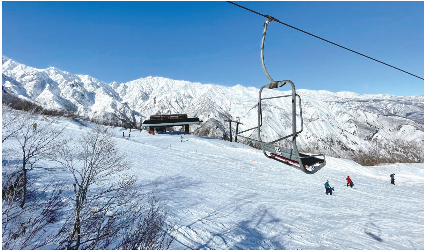
Sophisticated products ...